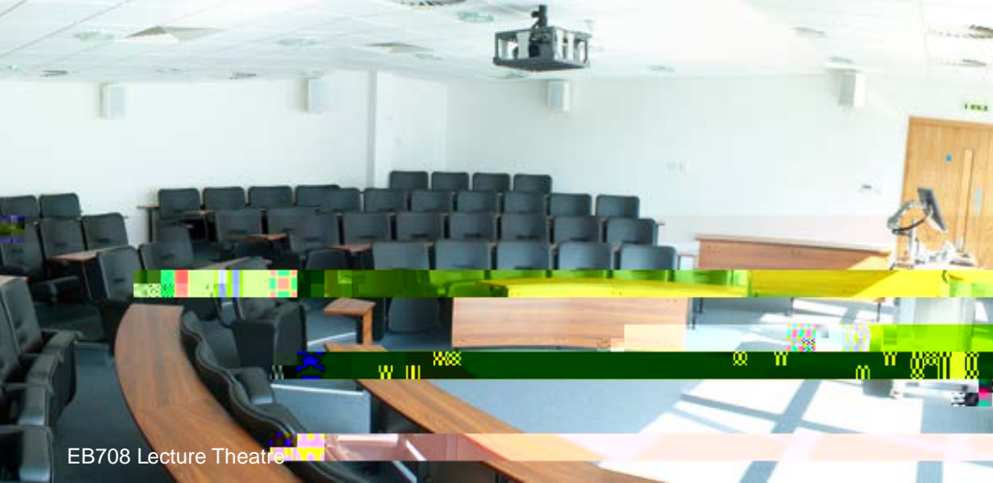
EB708 Lecture Theatre